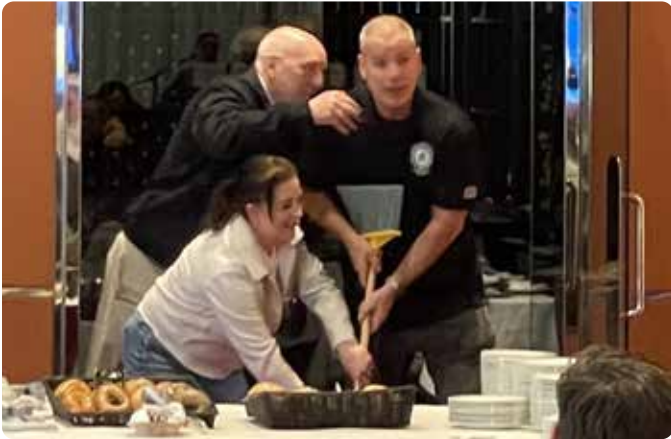
Securing a gun from an active shooter. (Simulation)